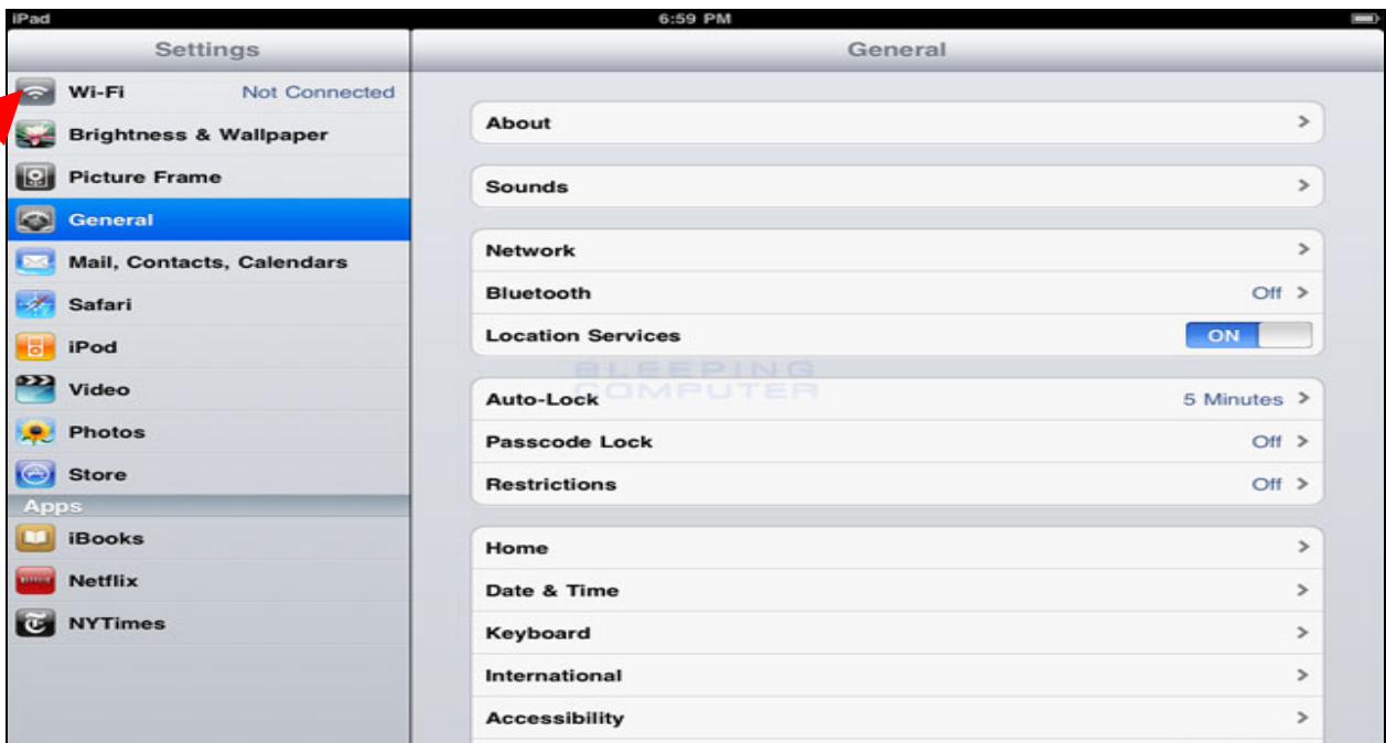
General Settings screen