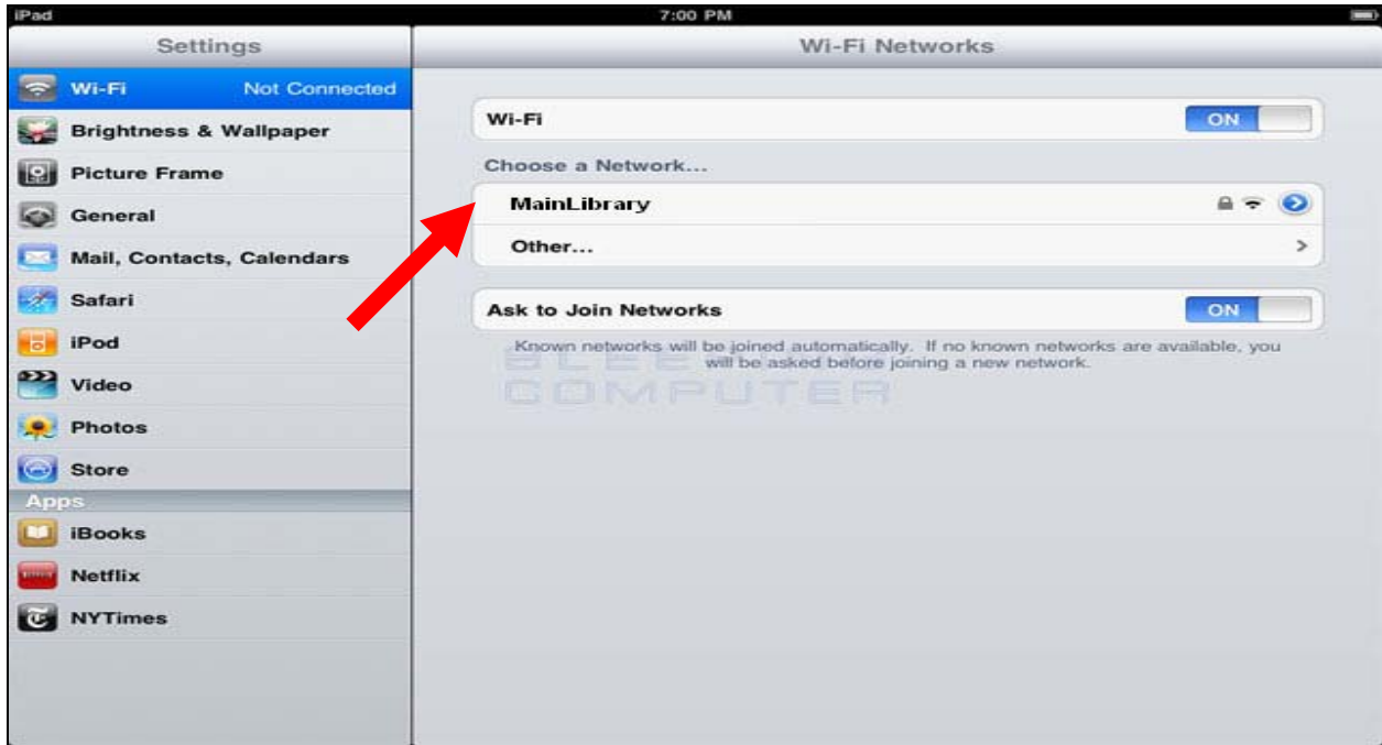
Choose an available wireless network screen